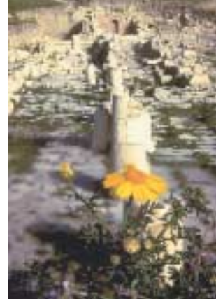
Amathunda, Limassol, Cyprus

DAY 8 Transfer back to Larnaca airport today for your return flight to Britain.