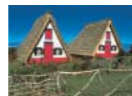
Madeira