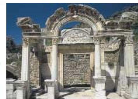
Ephesus, Turkey (Myst Ltd)

DAY 8 Today you will transfer from Kusadasi to Izmir airport for your return flight to Britain.