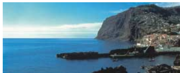
Camara de Lobos, Madeira