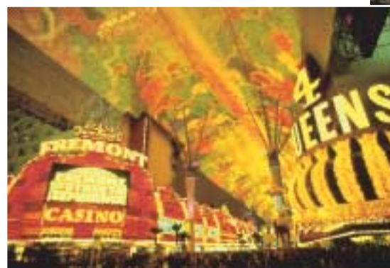
Las Vegas