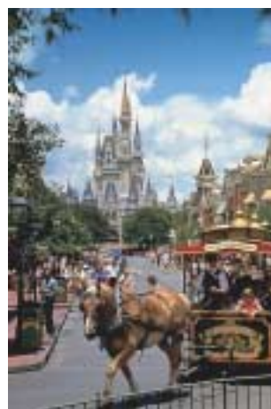
Main Street, USA © Walt Disney Company