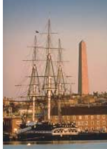
Boston (Boston C.V.B. Inc)