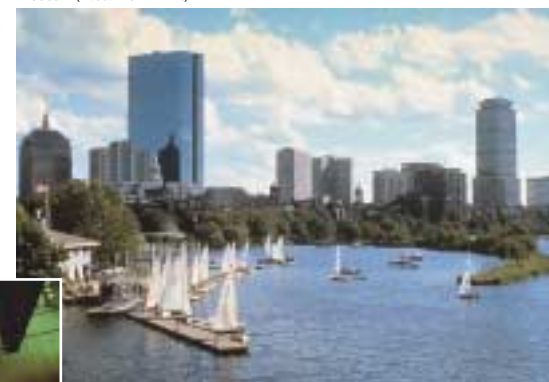
Boston (Boston C.V.B. Inc)