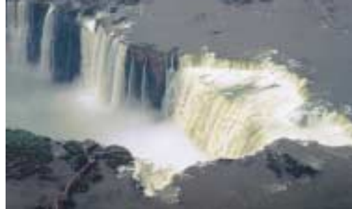
Iguacu Falls, Brazil