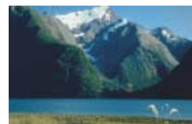
Milford Sound, N.Z.